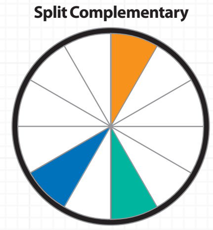
This relationship is made up of three colours. The principal colour and then two colours next to the complementary colour of the principal.